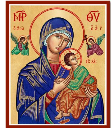
Our Lady of Perpetual Help Parish

✠ The Third Sunday of Lent ✠ March 20, 2022