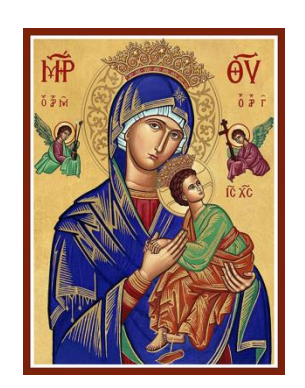
St. John Chrysostom Parish